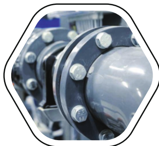
PIPE FLANGE JOINT

Forged flanges are essential components used to connect pipes, valves, pumps, and other equipment in a piping system. They provide strong, leak-proof joints while allowing easy assembly and maintenance. Manufactured for strength and precision, our flanges ensure secure connections and enhanced structural integrity across various industrial applications.