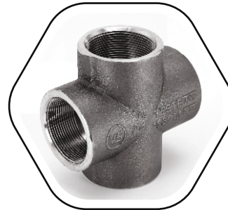
ELBOW & T