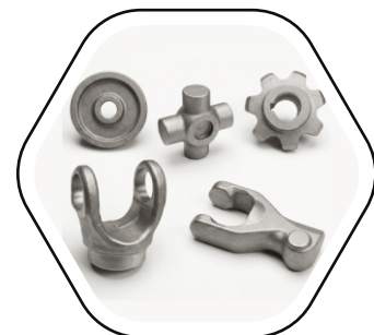
PARTS & GEARS