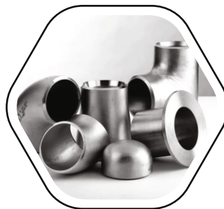
Buttweld and Forged Steel Fittings